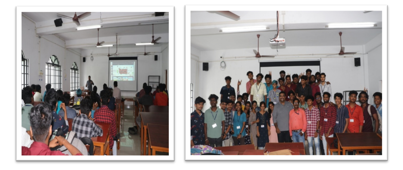
Workshop On 2D Animation Techniques and Story Development

A workshop on 2D animation Techniques and Storytelling methods was organized on 24th and 25th of August 2022 by the department of KAUSHAL KENDRA, Loyola College for the UG second year B.Voc 3D animation (21UAN) students.