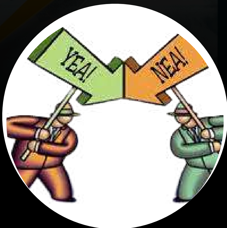
BLOCK & TACKLE