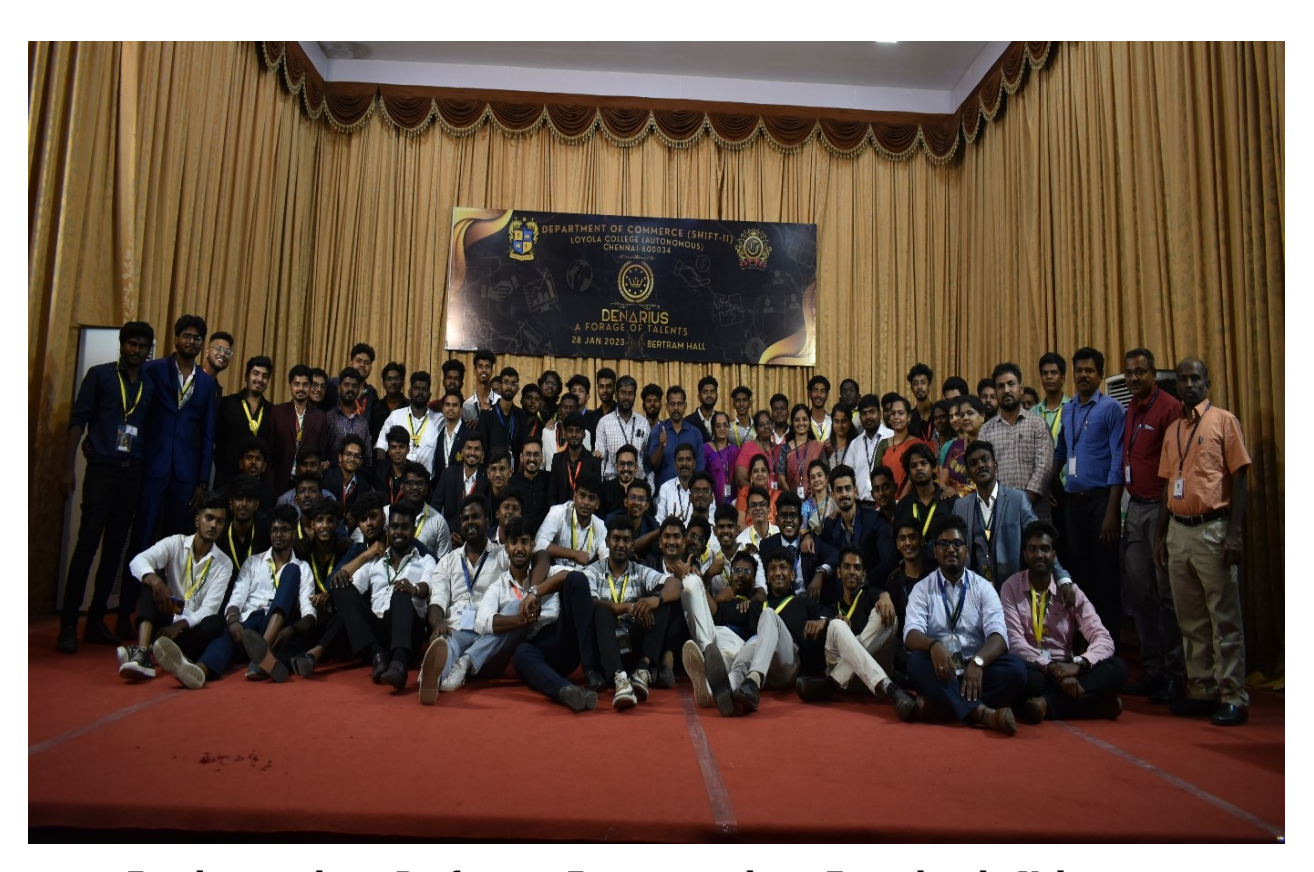
Faculty members, Professors, Forum members, Event heads, Volunteers.