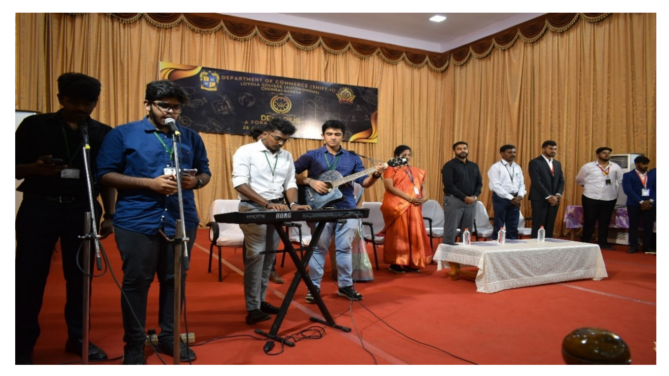
PRAYER BY DEPARTMENT CHOIR