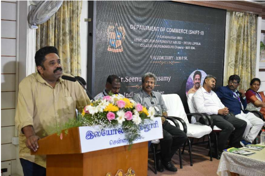
Chief Guest Thiru. Seenu Ramasamy, Indian Filmmaker addressing the gathering