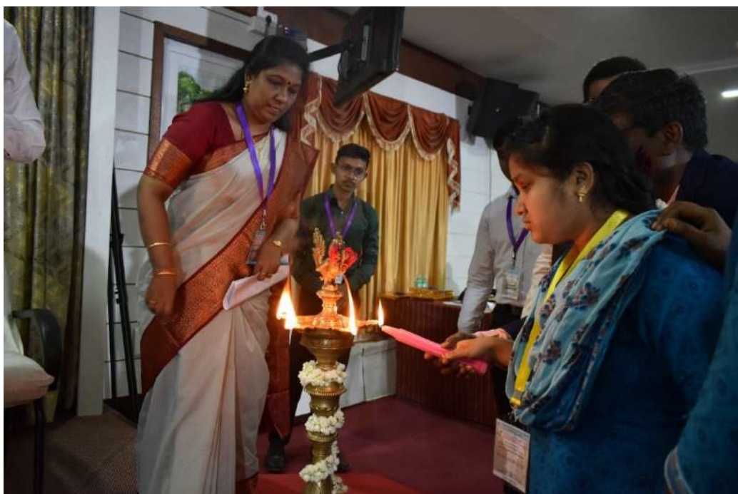
Lighting of the Lamp by Participants