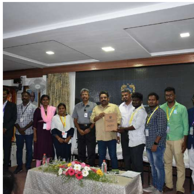
Distribution of Certificates to Participants of Presidency College.