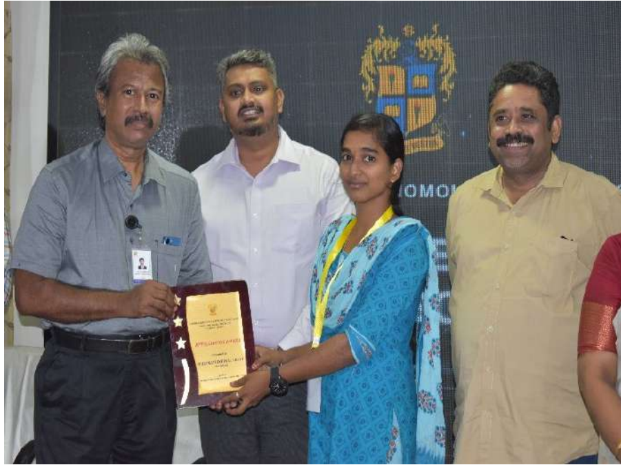
Award of Recognition to THUIMAI VIZHIHAL TRUST, Madurai.