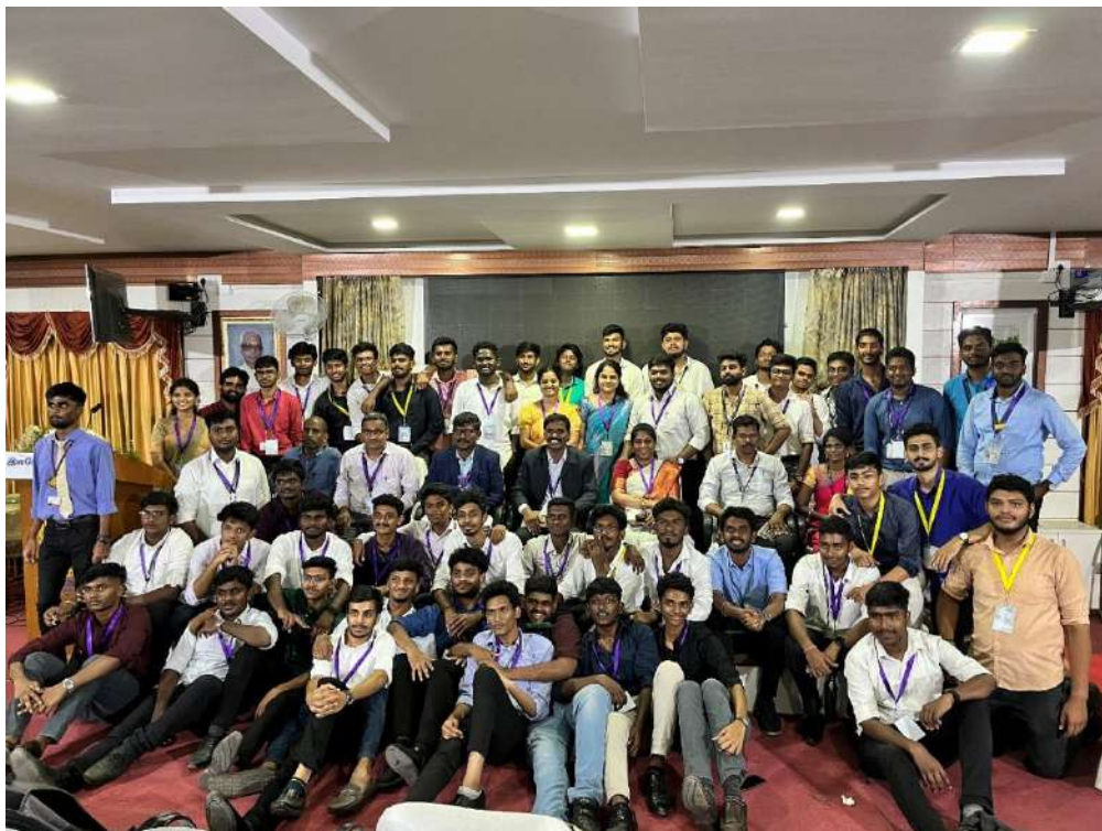
Group Photo of Organisers.