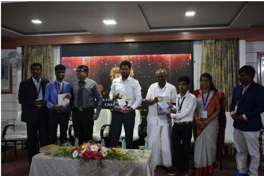
Book Received by the Student Representatives of the RCDA