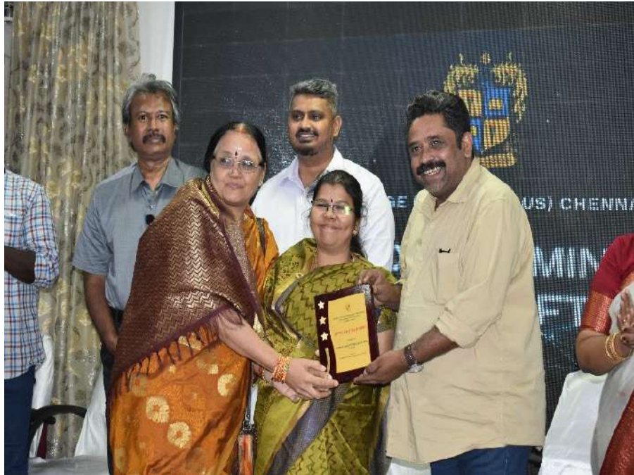
Award of Recognition to Sri Sathya Sai Seva Foundation