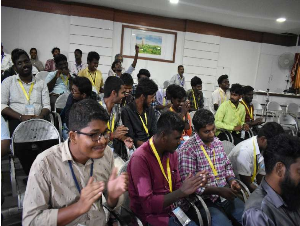
IMAGES OF STUDENTS ENGAGING THE SPEAKER WITH QUESTIONS