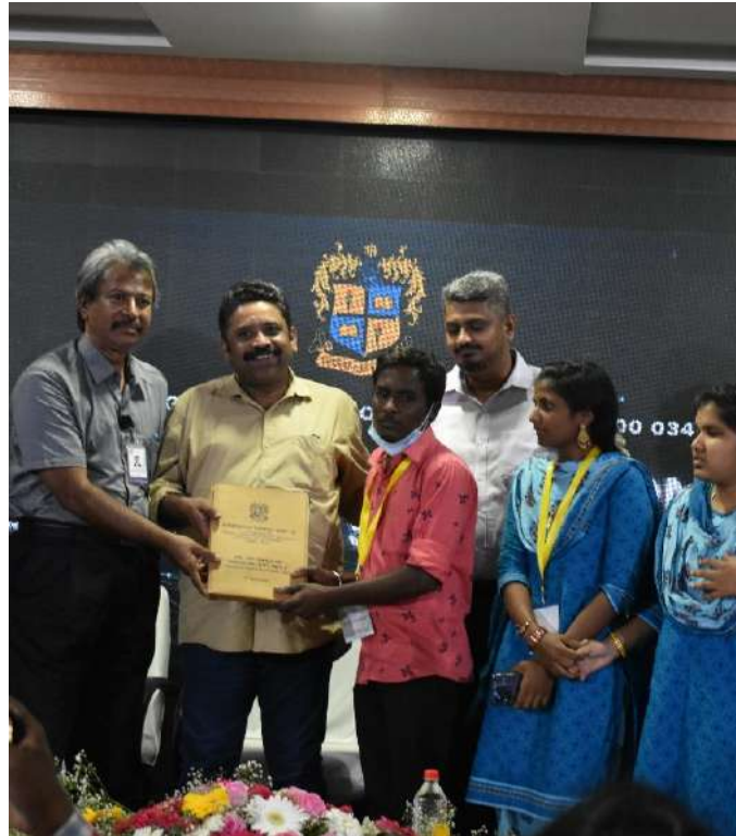
Distribution of Certificates to Participants of Thumai Vizhihal Trust, Madurai.