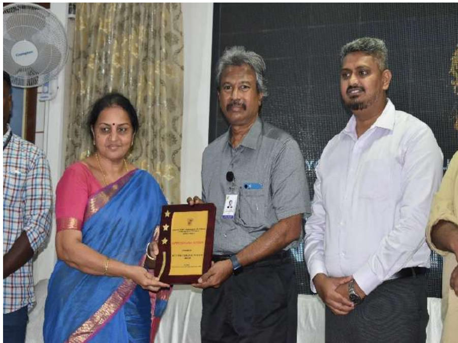
Award of Recognition to Help the Blind Organisation.