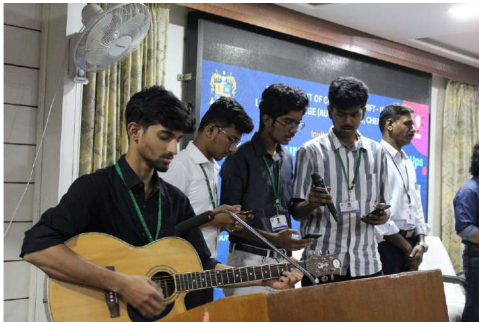
Prayer by Department Choir