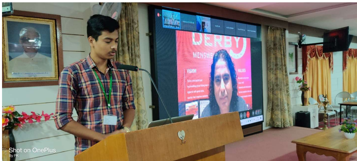
Q & A session