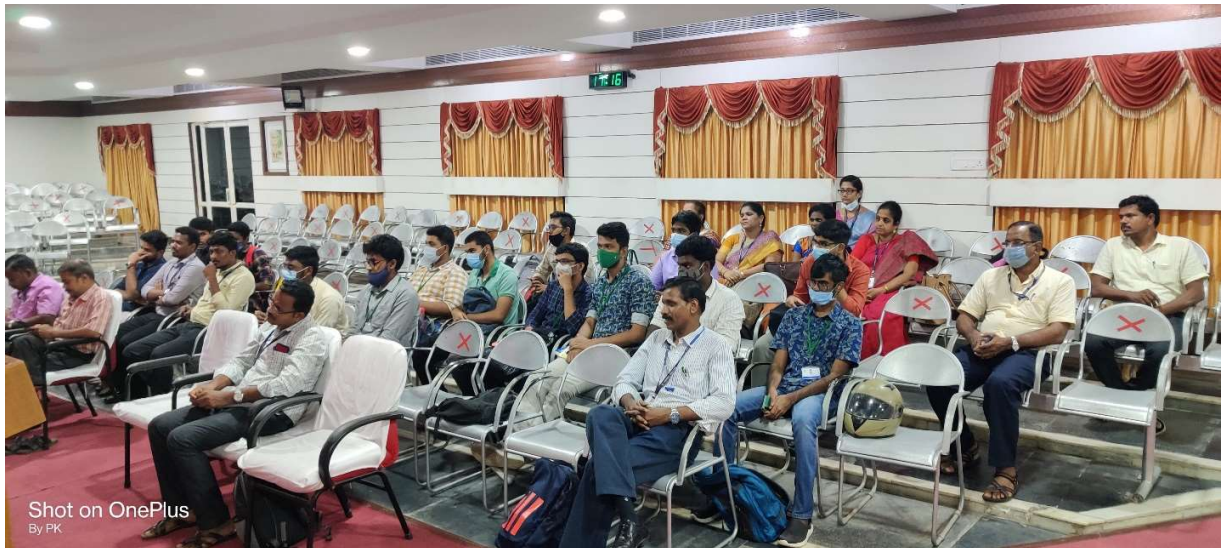
In-person participants of the webinar