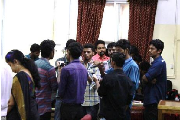
Prayer Song by Department Choir