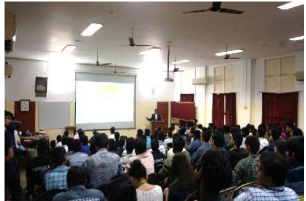
StudentParticipants in the Lecture