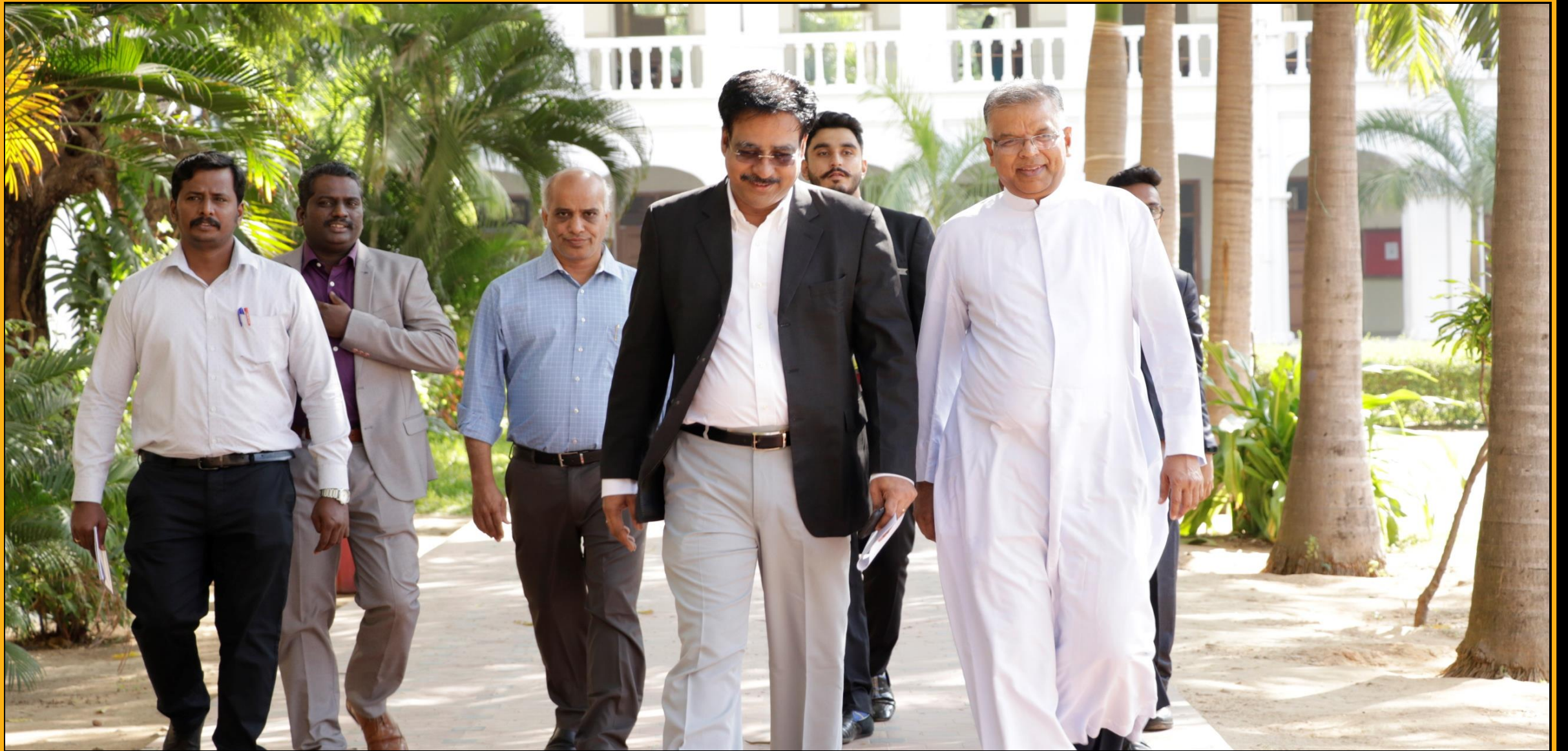
INNODHYA '20 (Day 1) - National Entrepreneurship Summit