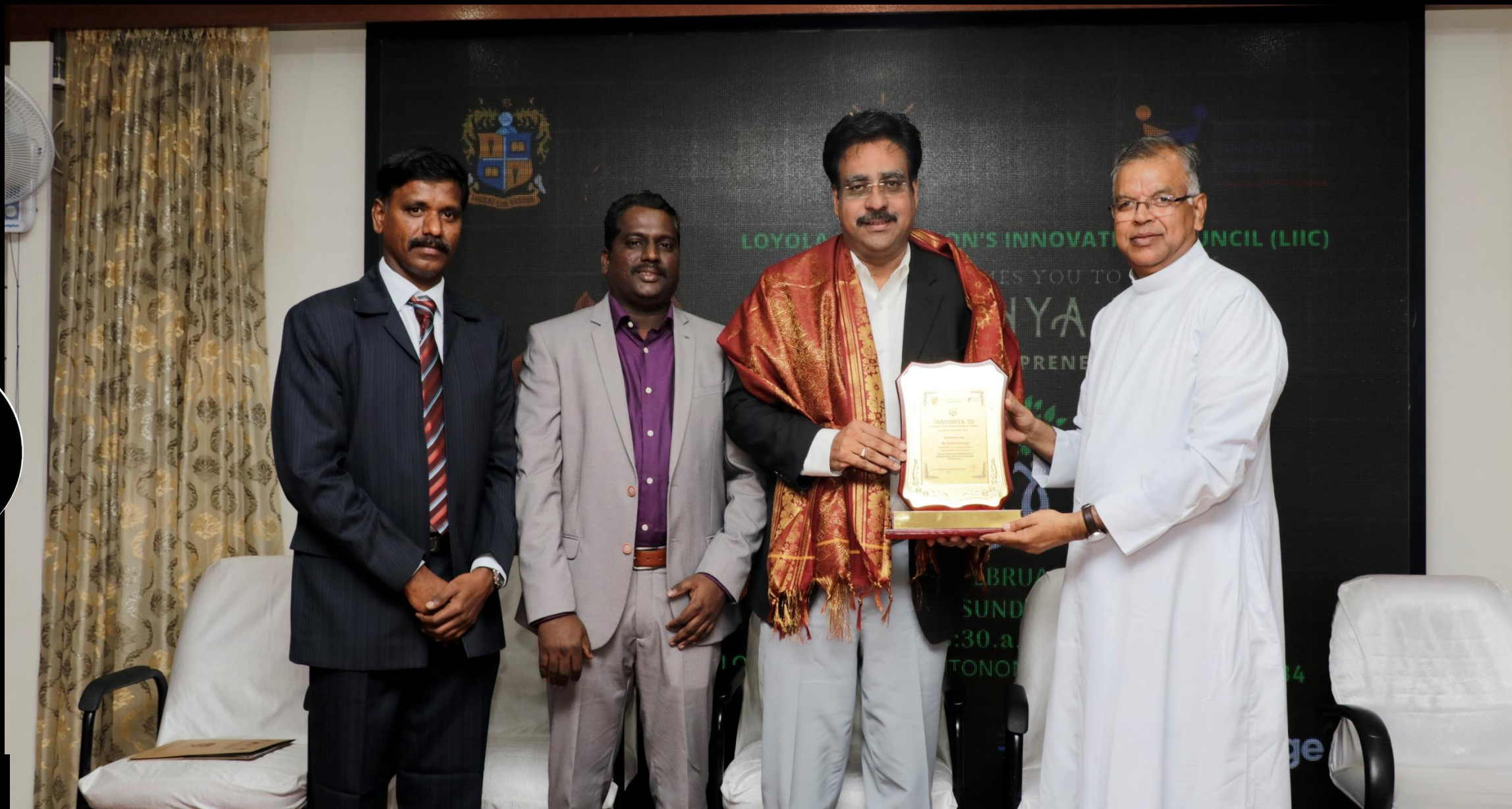
Felicitation of Chief Guest by Rev. Fr. Principal