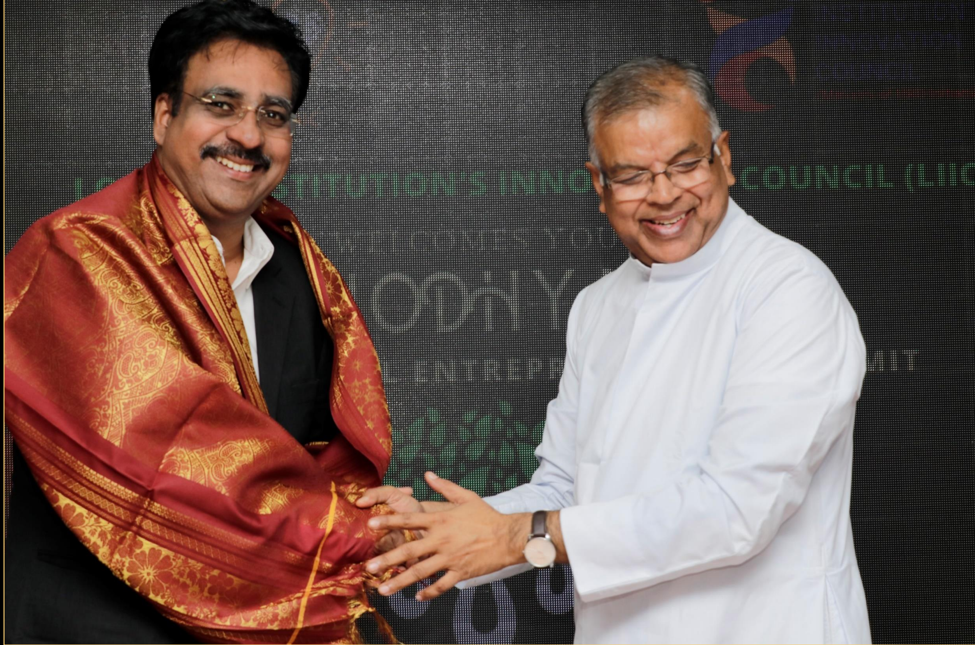
Felicitation of Chief Guest by Rev. Fr. Principal