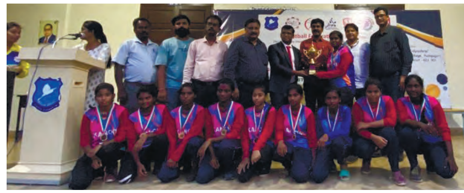
Fistball World Tour National ranking championship women's winner Chrome Tigers Club(Kanchipuram).

beat Chengalpet Spartans (Chengalpet) 13-11, 14and were placedfirst in the ranking. In the women's section Chrome Tigers Club (Kanchipuram) beat Global Health Care Sports Academy In the Men's section (Chennai) 12-10, 11-7 and were placed first in