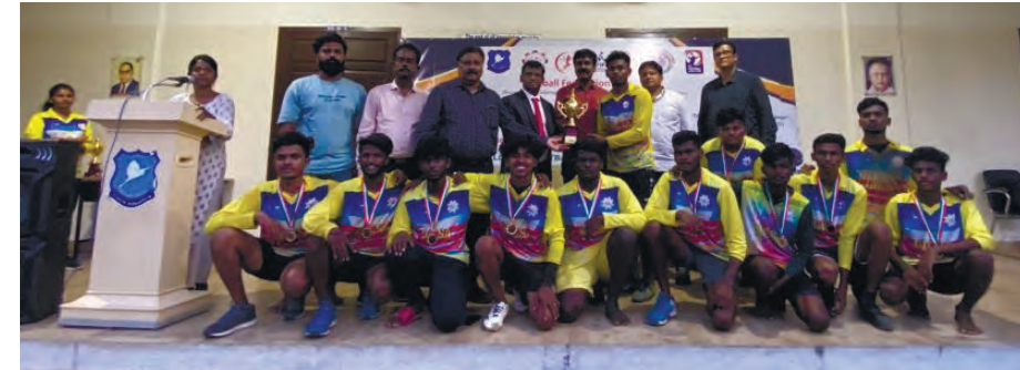
Fistball World Tour National ranking championship men's winner Global Health Care & Sports Academy(Chennai) team.

Global Health Care & Sports Academy (Chennai) the ranking.