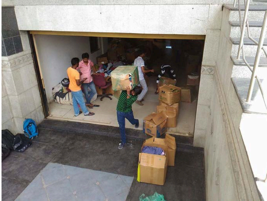
Our green rotaractors loading the boxes of dresses for our club office

This project is the first step of a huge Community service project to be carried out in a large scale. The aim of this project is to distribute clothing to children, women and men. This project is to be carried out along with the Rotaract Club of Loyola Community and the Department of Service Learning, Loyola College. A large number of boxes have been procured, out of this 100 boxes have been brought and stored in the Club office at 25 th Feb with the help the Green Rotaractors and the Board members.