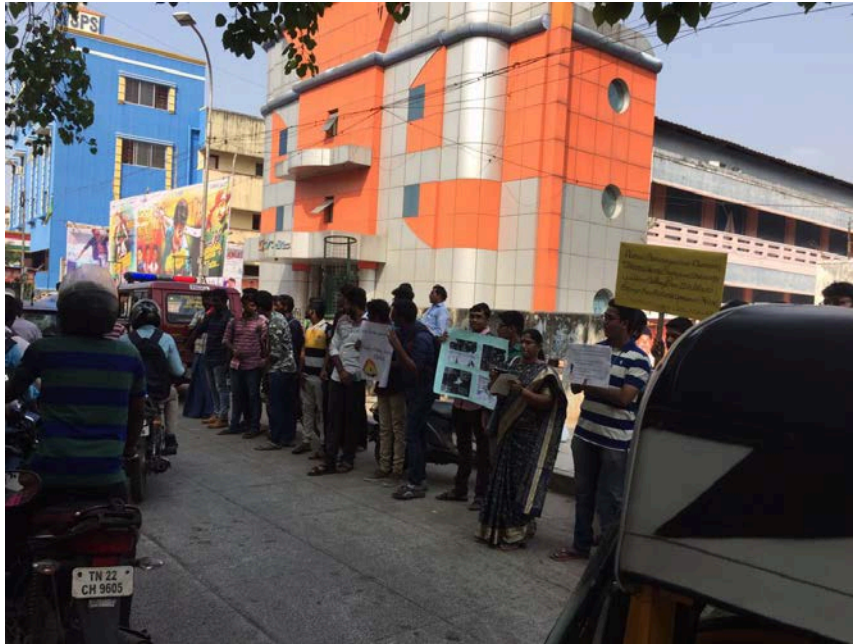
Awareness campaign conducted by our Green Rotaractors in Saidapet

An awareness programme was carried out by our club at Saidapet by the Green Rotaractors lead by the Faculty Coordinator and a few board members. The main theme of awareness was Fire Free Bhogi to protect and safeguard our environment. This was held by coordinating with the local Traffic Police. Students held charts and display boards while shouting slogans to create awareness on the issue. This programme was welcomed by the area people which made this programme a great success.