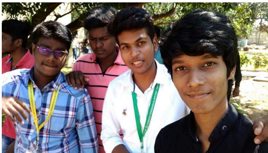
2.Participants from Rotaract Club of Lolyola College