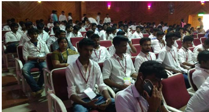
Students and staff co-ordinator participation in conference