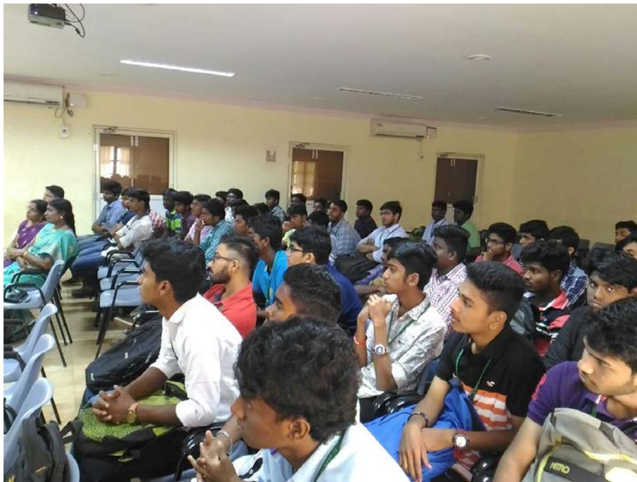
Members building their knowledge and skills through workshop on 3D printers

A workshop was organized by the CSI, Computer Science department for our Green Rotaractors in the campus. This workshop on 3D printing was attended by the Green Rotaractors irrespective of the departments which they belonged to. The audience were introduced with the evolution, history and latest developments of 3-dimensional printing. The workshop gained more attention after the benefits of using 3D printers were revealed. Also, the speaker had taken an extra effort to prepare a sample of 3D model by using the hi-tech printer. The workshop was thus highly useful for everyone, since new technology was introduced and its effectiveness was justified.