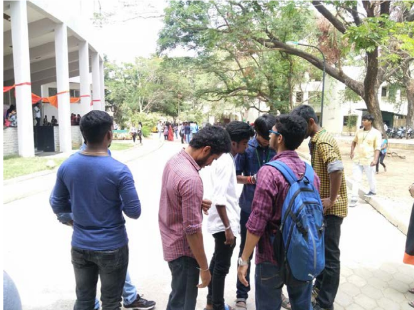
A few participants from Rotaract Club of Loyola Colleg]