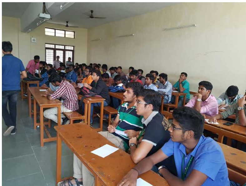
Green Rotaractors watching the movie on social justice and writing their learning from the movie