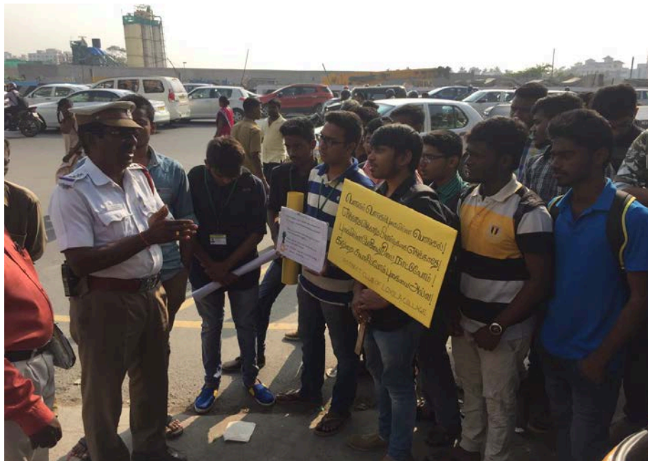
Interaction with the area Police by our Green Rotaractors