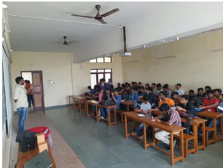
Board member welcoming and addressing the Green Rotaractors

Tentkottai an interesting initiative by our club on the Social Justice day on 20 th feb 2016. To create awareness on various important issues going on in our society two movies were projected to the Green Rotaractors in smart classrooms. The two award winning movies were Pink and Visaranai. These two movies were on the genre of social justice. After the movie, the Green Rotaractors were asked to write what they had learnt from the two movies. Thus, this event clubbed the fun and the awareness on social justice together proving this initiative to be a success.