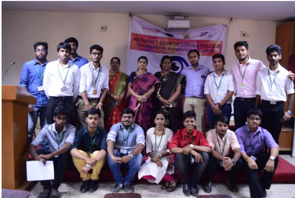
Valedictory of eye camp with deputy principle, faculty in charges and rotractors