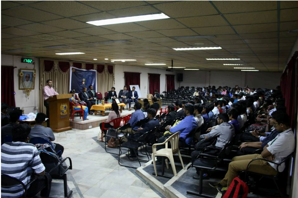
Guest of Honour addressing the gathering