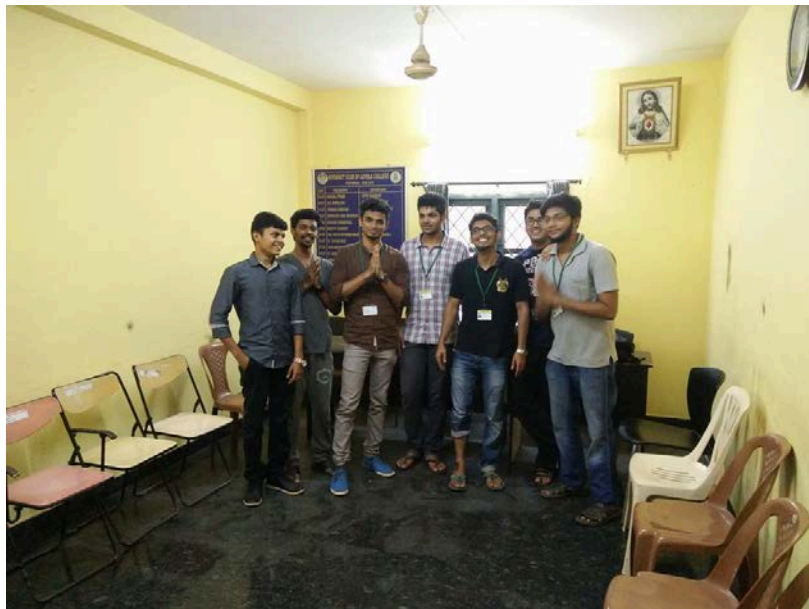
[The Cleaning and re-organization of the Club Office by the Board Members]