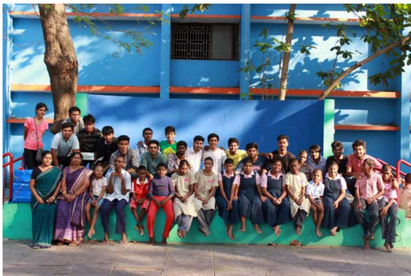
A happy picture of the Board members with the Children of the Ashram

The first Community service project for the year was Pudhu Varsha Vazhthu meaning New Year Greetings. This project was conducted in Bala Vihar Ashram for the Intellectually disabled Children and people. The club members visited this ashram to provide the required items which were collected by the club members. An hour spent with the special children by playing, dancing and singing created a deep impact on the hearts of our club members who went there. It made us realise how gifted we are. Instead of living selfishly the joy of living should be shared and services should be done for the society which will ultimately benefit us too. After a small interaction with the Staffs of the Ashram, the members came out with a feeling of happiness and satisfaction.