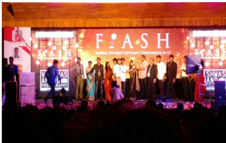
President of rotoract club loyola college receiving award in the conference