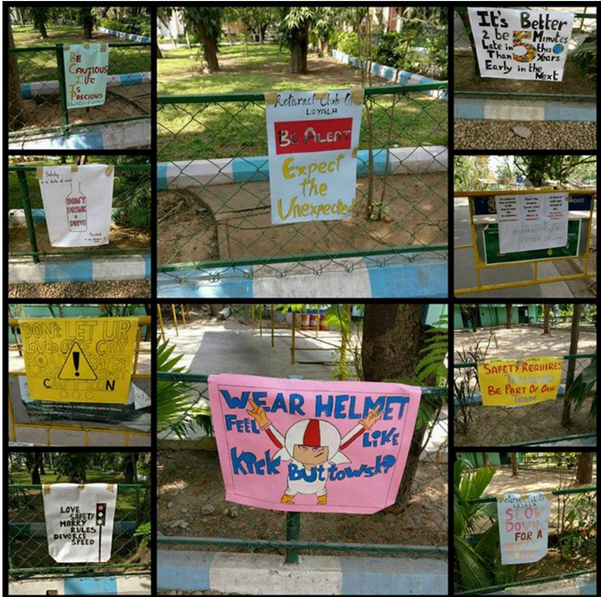
Posters and creative charts displayed in the college premises for awareness

The community service project on Road safety and regulations was held in our college. Creative charts and posters were made by the club members with a good sense of humour and with a tad of sarcasm to create awareness on road safety. The charts and posters were displayed in the college premises near the parking and the main entry and exit gates so that the students would take a note of them for their own well-being and the society's well being too.