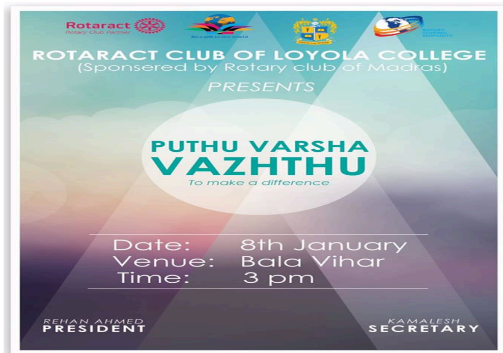
Poster of the Pudhu Varsha Vazhthu event