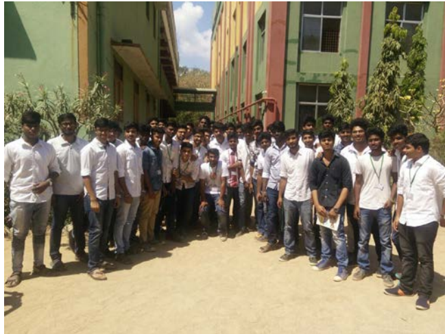
Participants from Rotaract Club of Loyola College

Selfie Pre-Conference was held on 12 th feb 2017 in KRMCC college Adyar, it is the pre-conference for this year ADRC. Variety of cultural programmes were held for the attending rotaract clubs. This fun filled event was attended by our Green Rotaractors with enthusiasm. The same amount of enthusiasm and charisma prevailed even when our members performed in the cultural events. This event was made success by our members by bagging the second prize in Face Painting, Adzap and the title winner in the event Mr.Selfie. This event filled with fun and frolic turned out to be great experience for both the Green Rotaractors and the board members.