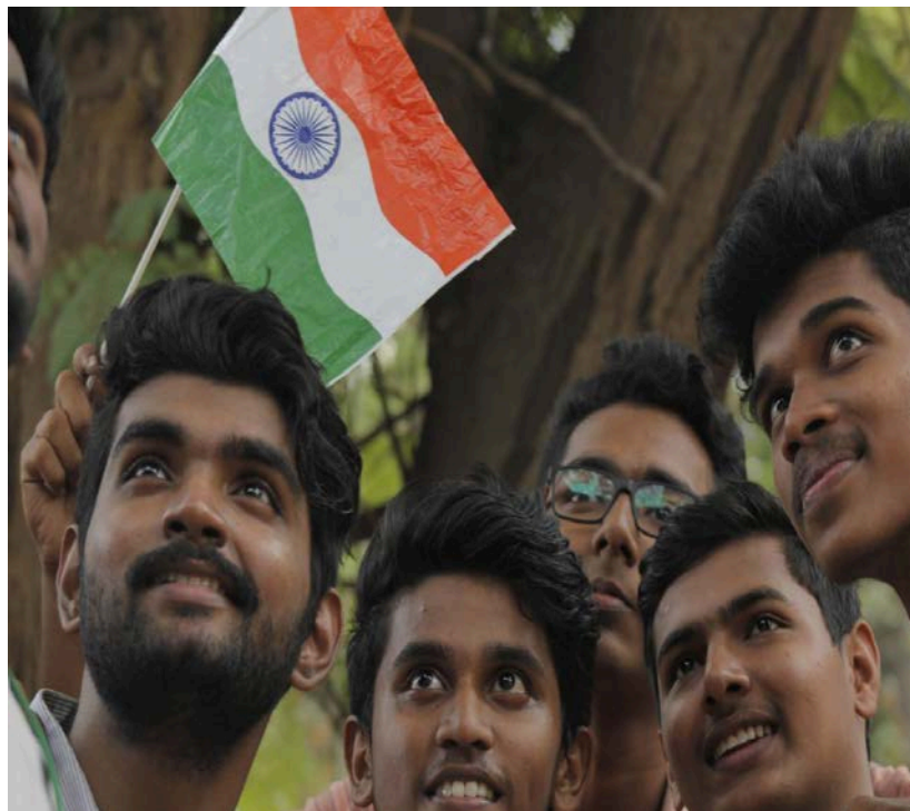
Winners of the Treasure hunt event celebrating