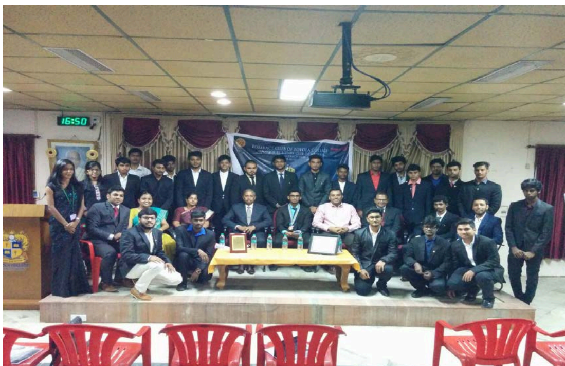
The newly inducted Board of RCLC