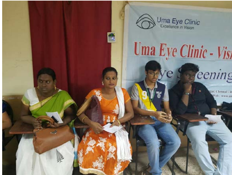
Waiting for eyecheckup by transgenders