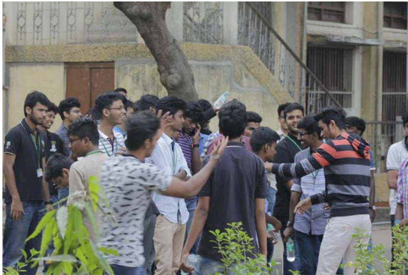
Dividing the Green Rotaractors into teams for the Treasure hunt event

The Club service project carried out the 'Treasure Hunt' which is a legacy of the RCLC. This event is organised for the Green Rotaractors for many years. It is a fun filled event of finding clues whilst building trust and friendship with new people. Around 180 Green Rotaractors participated in this event managed by the board members. The whole of our college premises was used for this event and totally ten clues were given to the shuffled teams to find. The event lasted for around 2.5 hours starting from 9-11.30 a.m. Prizes were given to the members of the winning team.