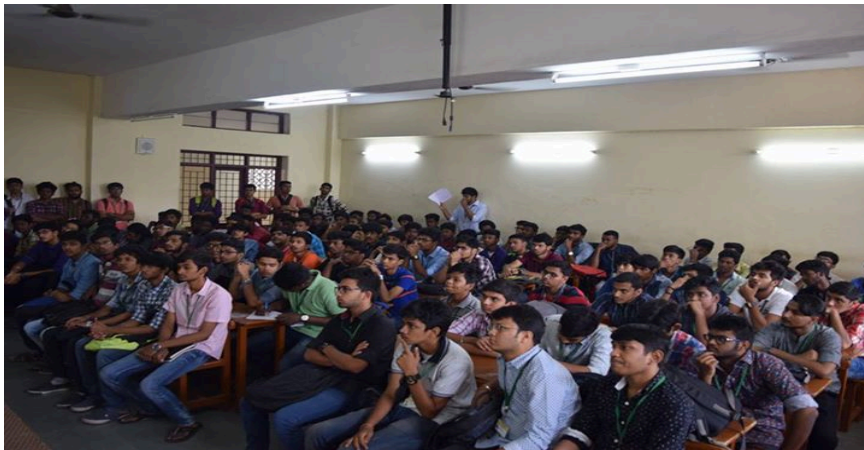
Students interacting with the Board members

Few of the enthusiastic Green Rotaractors gave ideas for projects on the spot and was immediately accepted by the board members. The Green Rotaractors were voluntarily coming up to join the cultural teams and few members were interested in enrolling for the annual Rotary Youth Leadership Award. The details of the club members were collected simultaneously while checking the candidates present. This effective orientation ended after an address from the Faculty coordinator .