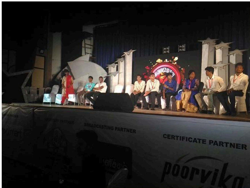
Picture of Presidents and co-chairmen from host clubs of oceanus

This is a Cultural event organized for the Rotary District 3230 by the Rotaract Club of Vishwahita along with other clubs in which Rotaract Club of Loyola College played a very integral part. The main aim of this event was that the money collected in this event is to be donated to the Gifted Children of a village development society. Our club members and Green Rotaractors were very much happy and pleased to be a part of such a fulfilling event. Rotaract club of Loyola college helped to conduct this event in a successful manner by taking care of the Registration desk helping the Transport committee and sponsoring ₹10,000 for the event. Around 50 Green Rotaractors attended this event.