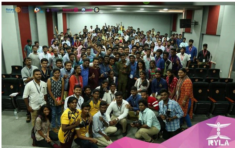
The participants of the Rotary Youth Leadership Award 2016

The Rotary Youth Leadership Award camp will be held each year to train the youth on being effective, efficient leaders with the sense of brotherhood and a drive to do service to the society. This year's RYLA was held at Hindustan University for 3 days where food and excellent accommodation were provided to the participants. 5 Green Rotaractors participated in this event and benefitted from it. New friends, a sense of brotherhood, bonding and three days filled with exciting games, pep talks by famous guest speakers, cultural events and much more were experienced by the participants.