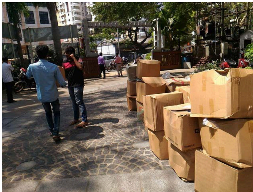
Board members segregating the boxes for loading into truck