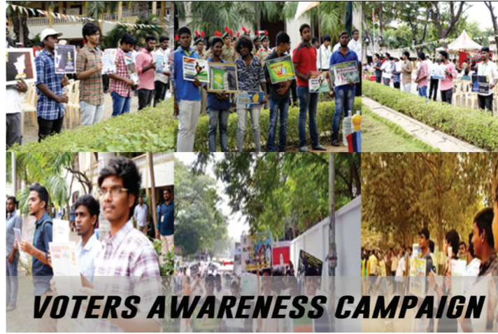
VOTERS AWARENESS CAMPAIGN

The Loyola Students' Union members involved the services of the alumni to create and spread awareness on 'Right to Vote' through a campaign. Posters and placards were made with slogans encouraging the public to cast their votes wilfully and diligently. On the 19th and 20th January, 2019 the students conducted the campaign during the Veedhi Virudhu Vizha and also took part in the procession on the 20th January, 2019.