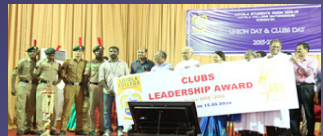
Union Day & Clubs Day