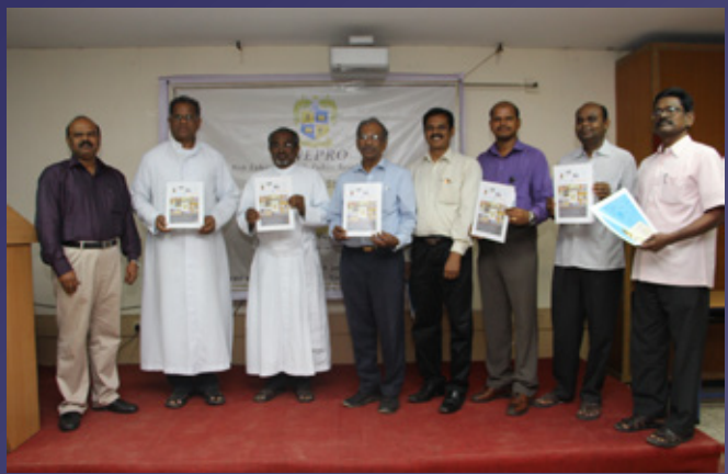
Loyola Academic Newsletter released